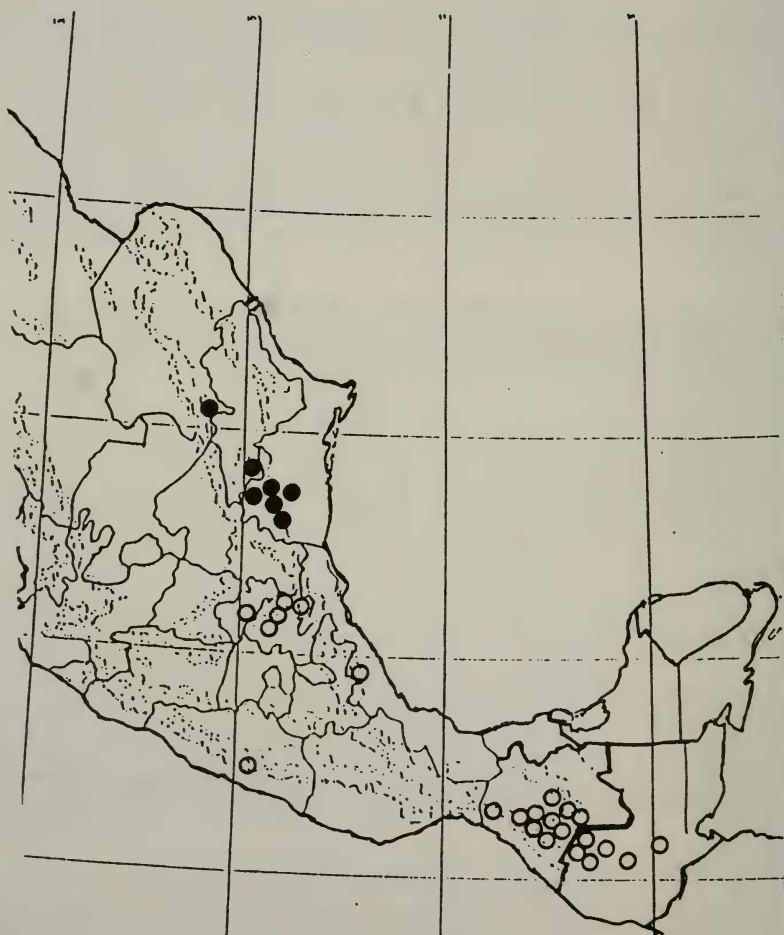
Figure 1. Distribution of Rhus schiedeana (open circles) and R. tamaulipana (closed circles).